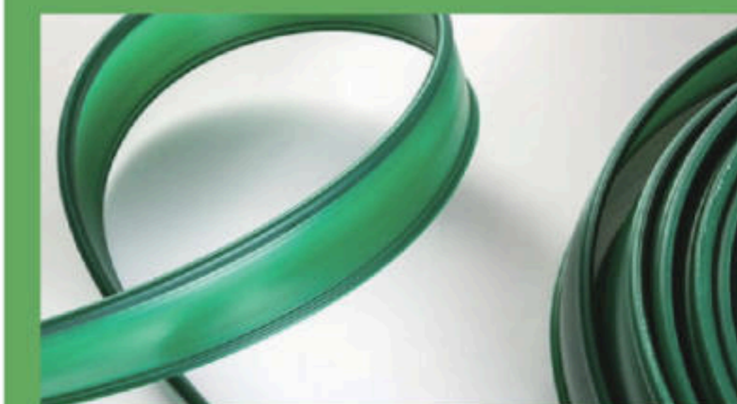
physical object image