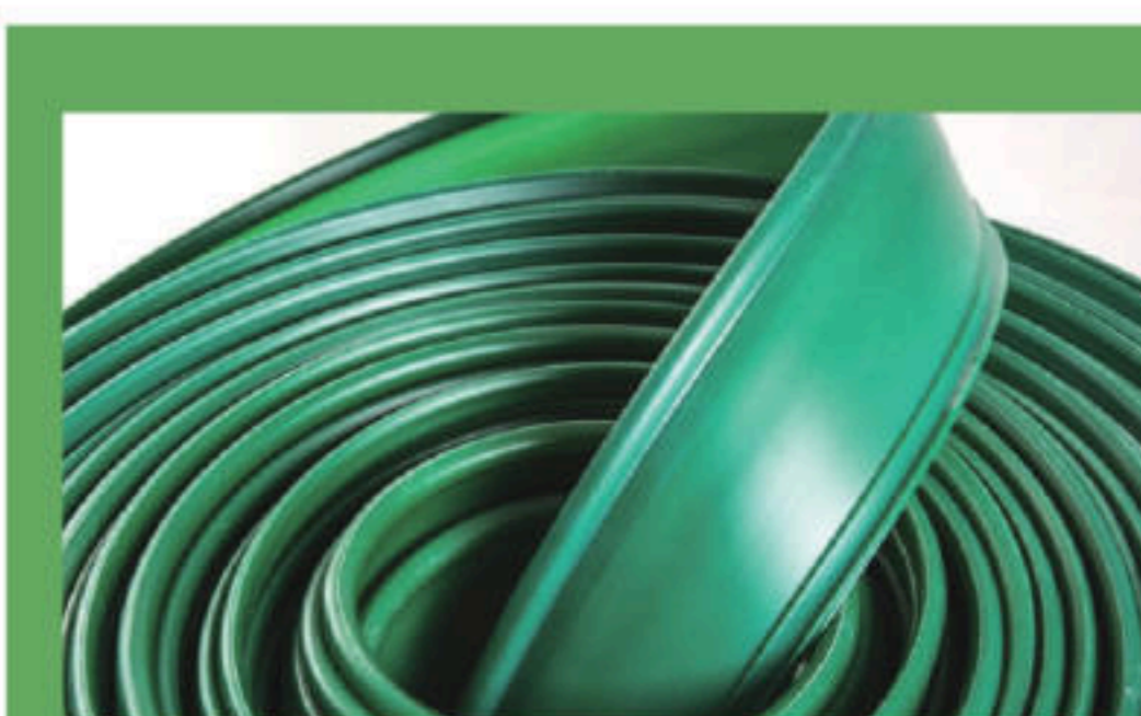
physical object image

high10cm*long50m high15cm*long50m high10cm*long100m high15cm*long100m